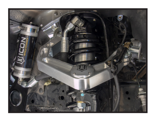
[TECH NOTE #2]